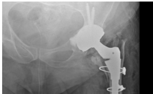
Post Op: CERAMENT® BVF is visible in the medial acetabular defect.