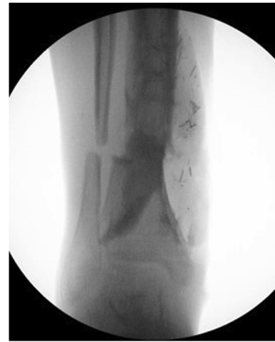
Fig. 2. (continued)

The tibia was the most commonly involved bone (47 patients/90%) followed by the femur (2 patients/4%), the foot (2 patients/4%) and in 1 (2%) patient there was an infected total ankle replacement (TAR).