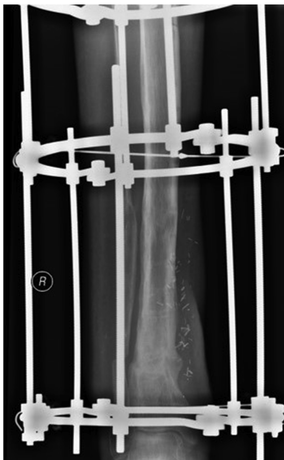
Fig. 2. (continued)