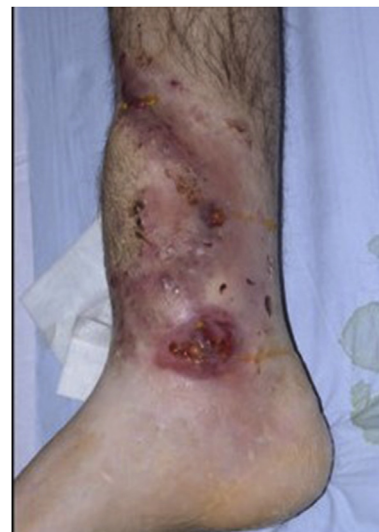
Fig. 2. a–e: (a) Implant related chronic osteomyelitis of the tibia with sinuses. (b) Tibial shaft non-union in the same patient treated with plate/screws for open fracture; (c) During surgery, infected skin, soft tissues and infected/dead bone were excised; (d) The medullary canal was opened both sides and the remaining cavity was adequately prepared and filled with CERAMENT G; (e) Instability was present (CM stage IV osteomyelitis) and an Ilizarov frame was added to the construct.2f–g: At 8 months post-surgery the tibial non-union has gone on to complete healing and the biocomposite has been replaced by bone and started remodelling.

infected/devitalised skin, sinus tracts and soft tissues and bone was excised. When necessary, a plastic surgeon performed or advised on extension of the skin incision in order not to jeopardise performance of successive flaps or skin viability. Infected metalwork was removed until healthy and bleeding bone. Multiple deep tissue samples were collected, sent for microbiology and intravenous antibiotics were started according advice from an infectious disease specialist. The remaining cavity, after excision of infected bone, was washed then irrigated with dilute (50/50) hydrogen peroxide solution and dried by gauze packing. The dry cavity was now filled with CERAMENT G. If instability was present (i.e. CM stage IV osteomyelitis) external fixation (usually an Ilizarov frame) was added to the construct Fig. 2a–e. Provision was always taken to facilitate access to the area when a free/local flap, split thickness skin graft (STSG) or primary closure was required from the plastic surgery team. Post operatively, antibiotic treatment continued for a period up to 12 weeks. After removal of the circular frame a fracture boot was used for a period of 4 weeks and full weight bearing was allowed.